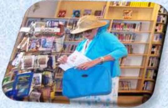
The Hare Bay/Dover Public Library Burglar and the winners of library prizes

The Summer Reading Program at Hare Bay/ Dover Public Library was a success. Seventeen kids registered and enjoyed a summer of reading, fingerprinting, crafts and using spy kits. There was also a visit from the '009 Criminal', and the kids thought it was real. They were amazed that she was stealing from the library, with everyone watching – but from their descriptions, the thief would never have been caught.