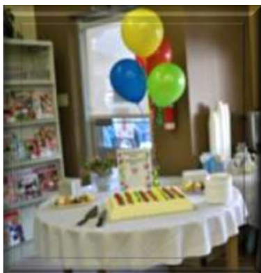
Patron Day at the Michael Donovan Public Library

This was a busy fall for the Michael Donovan Public Library . In addition to regular duties, the library was rearranged to accommodate more space for programming, adding a children's nook with a dedicated child's computer and furniture. This doubles the amount of storytime programming. In October two special programs for Thanksgiving and Halloween were held. Everyone enjoyed the stories, treats and games. In November the library hosted a patron appreciation event. Patrons were surprised and pleased by this gesture and thoroughly enjoyed the afternoon. Currently there is a Food Drive and Book Exchange and two special Christmas programs in the month of December.