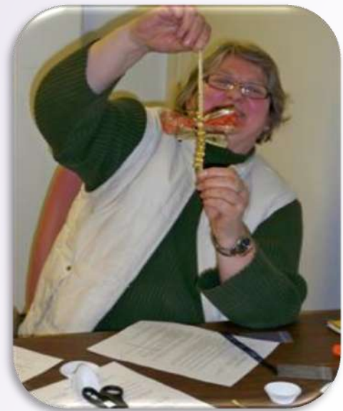
A Successful Participant in the Christmas Craft Class