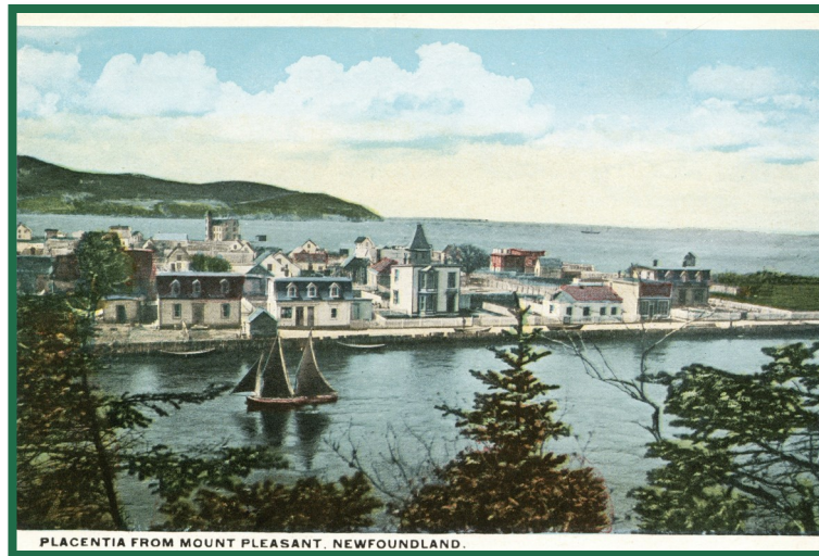
Placentia from Mount Pleasant, Newfoundland. Postcard Collection TV273.

[Voters List 1917]: [ST. JOHN'S EAST, PLACENTIA, and ST. MARY'S]. (in-library use only)