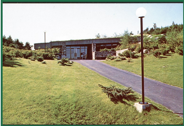
Interpretation Centre for Castle Hill National Park, Placentia. Postcard Collection M52.