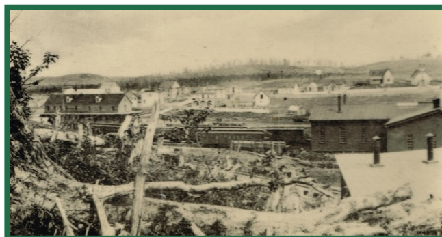
Whitbourne. Postcard Collection TV181.

For more information and additional available resources, please email reference@nlpl.ca