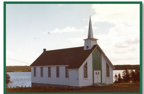
Barnabas Anglican Church, Blaketown