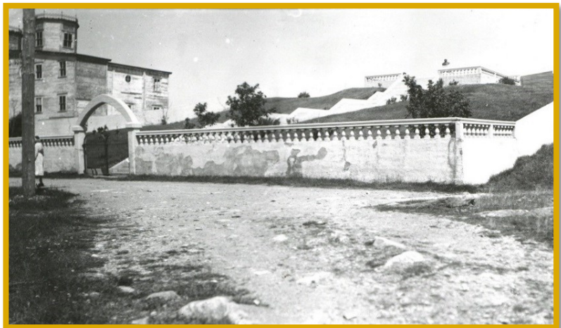
Sir William Coaker's Tomb, Port Union.