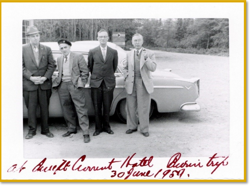
Lodge group at Swift Current Hotel, June 30, 1959.