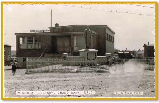
Memorial Library, Grand Bank. Postcard Collection TV60.

Inscriptions from the Anglican Church cemetery, the Salvation Army cemetery, and the United Church cemetery: the town of FORTUNE. 1986. (in-library use only)