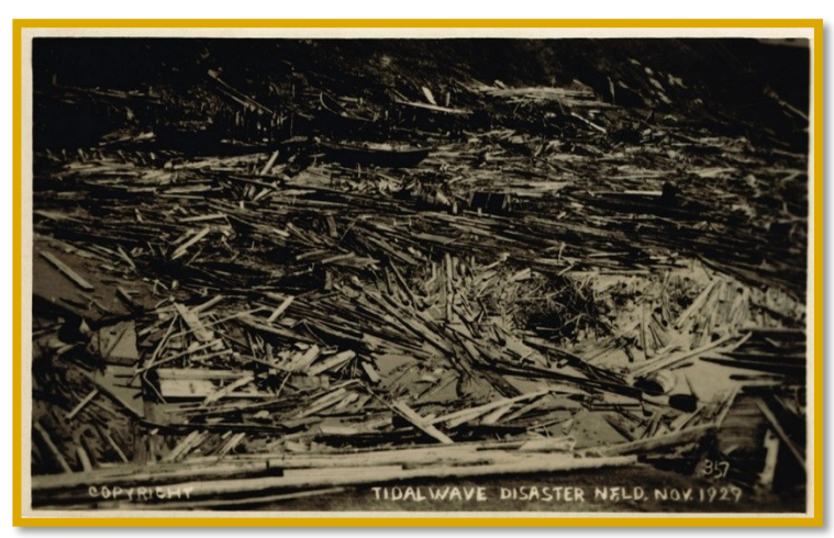
Tidal Wave Damage, Burin Peninsula. Postcard Collection TV192.