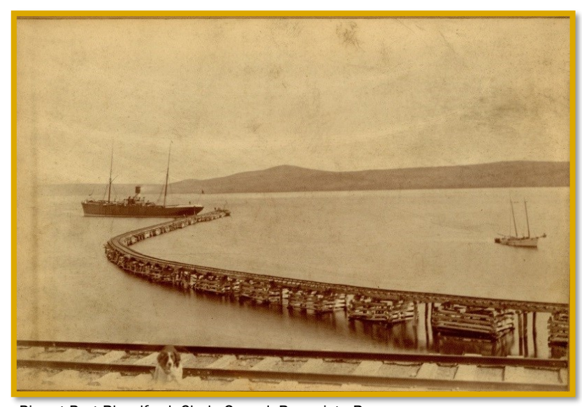
Pier at Port Blandford, Clode Sound, Bonavista Bay. Newfoundland Geological Survey PA1615, C491.

[Yearbook] (St. Gabriel's All Grade School, ST. BRENDAN'S): 1988. (in-library use only)