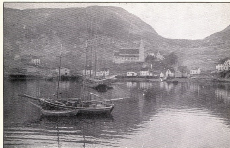
BELLEORAM, FORTUNE BAY.