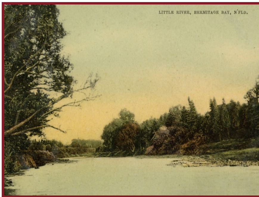
Little River, Hermitage Bay.