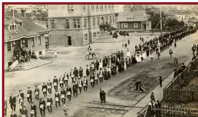
Untitled. Grand Falls. Postcard Collection GFW05.