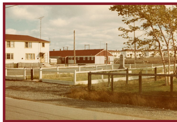
War Memorial and Curling Rink, Buchans.

GRAND FALLS-WINDSOR: the place and its people / by the Grand Falls-Windsor Heritage Society Inc. 2005. (available for loan)