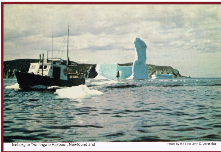
Iceberg in Twillingate Harbour.