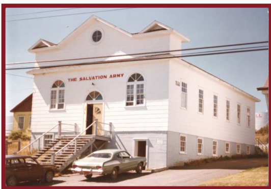
Lewisporte, 1978. Hunt and Murrin Collection MA1-105.

Islander ( Coaker Academy, NEW WORLD ISLAND ): 1970, 1975, 1980. (in-library use only)