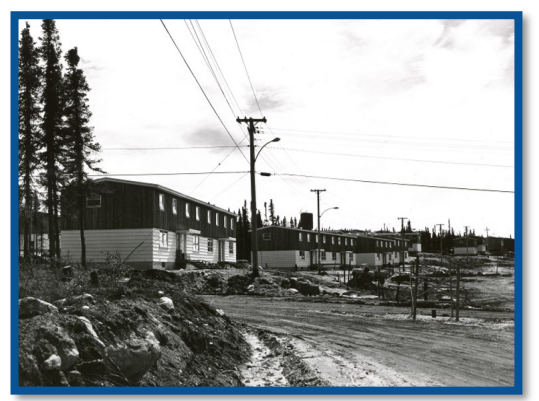
Wabush. Street & town houses (to become Duifield St. & Bond St.) Perlin Collection PA1524, C432.