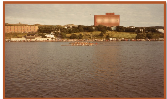
Championship Race Regatta 1982.

The Spencerian (Bishop Spencer College, ST. JOHN'S): 1929, 1930, 1932, 1945, 1947, 1953-59. (in-library use only)