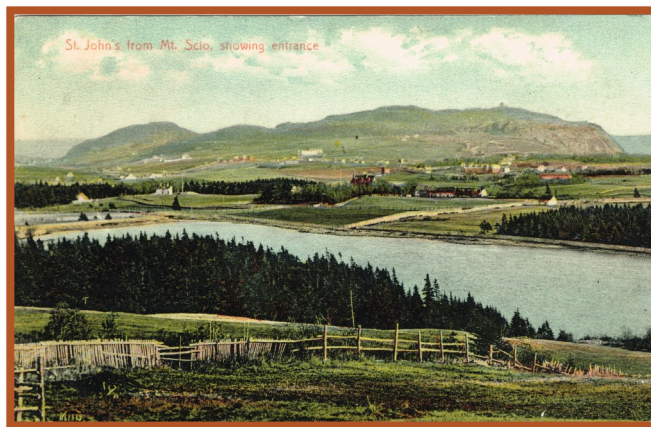
St. John's from Mt. Scio Showing the Entrance to the Harbour. Postcard Collection SJ63.