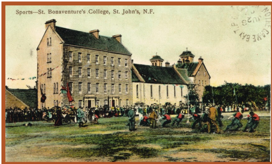
Sports—St. Bonaventure's College, St. John's, N.F. Postcard Collection SP26.

The Adelphian (St. Bonaventure's College, ST. JOHN'S): 1903-09, 1911-17, 1919, 1925-26, 1929-30, 1931 (Diamond Jubilee issue), 1933-35, 1939, 1941, 1945-47, 1949-53, 1957 (100th Anniversary issue), 1960-62, 1977-78, 1982 (125th Anniversary). 1984. (in-library use only)