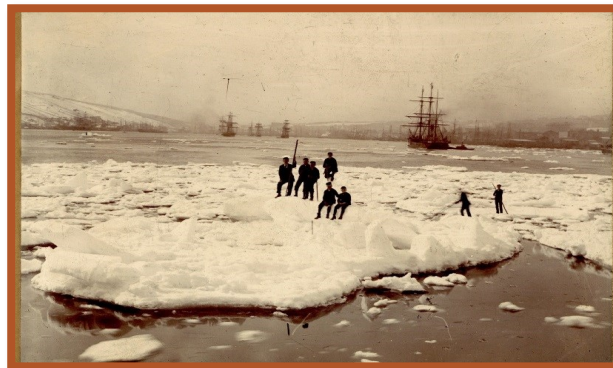
Number of older boys and sealers on ice flows, St. John's Harbour. PA1582, C458.