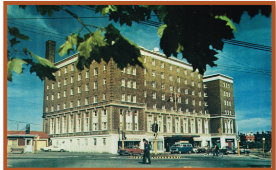
Hotel Newfoundland. Postcard Collection SJ161.