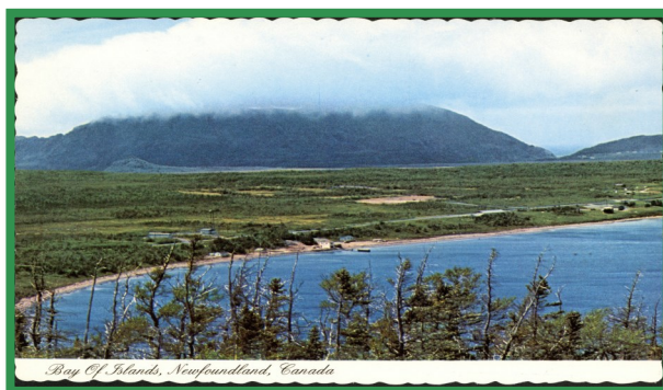
Bay of Islands. Postcard Collection SY103.