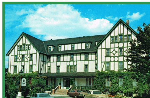
Glynmill Inn, Corner Brook. Postcard Collection CB4.

The Humber connection: community directory of the HUMBER region [2009-2023]. (in-library use only)