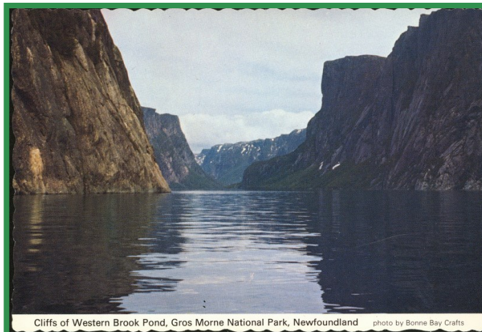
Cliffs of Western Brook Pond, Gros Morne National Park. Postcard Collection SY87.

The Progress ( Salvation Army School, TROUT RIVER ): 1946. (in-library use only)