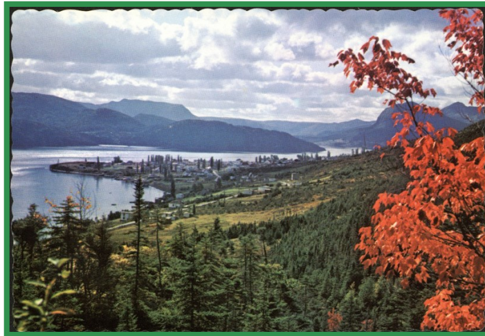
Woody Point and Curzon Village. Postcard Collection SY108.

The Killdevil Lodge experience in GROS MORNE National Park / by Stewart Payne. 2019. (available for loan)