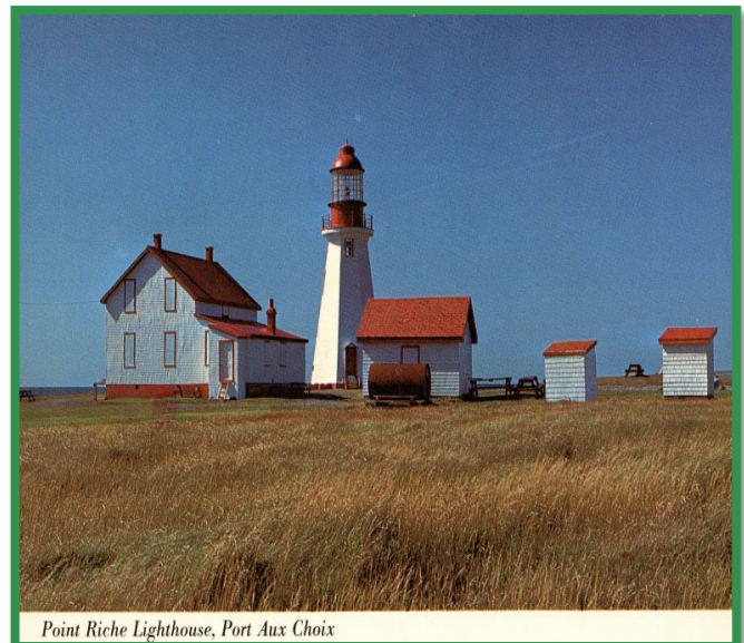
Point Riche Lighthouse, Port Aux Choix

A well-travelled Way: an autobiography [FLOWER'S COVE] / by R. Clifton Way. 2013. (available for loan)